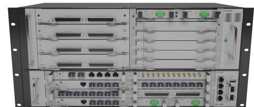
VCL-1400 - 7 Slot with expansion chassis