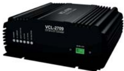
DIN Rail Mount Version

VCL-2709 is available in DIN Rail mount version and 1U high, standard 19-inch rack mount version.