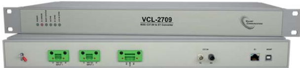
1U high, standard 19-inch Rack Mount Version

The VCL-2709, IEEE C37.94 to E1 Converter is a ruggedized and robust, sub-station-hardened protocol converter that converts IEEE C37.94 data to E1 data. VCL-2709 supports point-to-point applications.